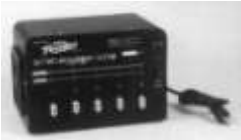
Battery Management System